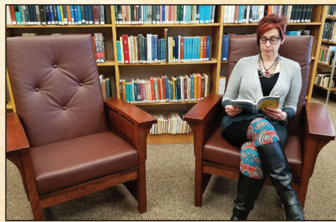
New library seating areas