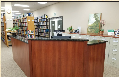
New library desk

Your continued support helps the library to continue adding new materials and preserve the history. We thank you ever so much and are grateful to be of service here at YOUR metaphysical library.